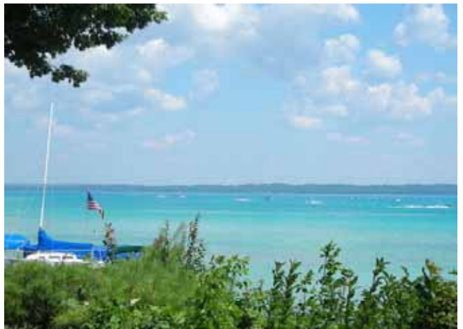
Here's a view of Torch Lake

conveniently for us) between the upper and lower lakes of Lake Leelanau. It was an interesting coffee shop complete with a TV which was tuned to the Tour de France. This beanery also sported wireless internet connection and the locals were making good use of it. Several accommodating fellows checked the local radar which clearly (clearly) indicated any bad weather was miles north of the peninsula so we had nothing to worry about. After enjoying this fine establishment (and I do highly recommend you stop should you ever be in the area), we continued north on